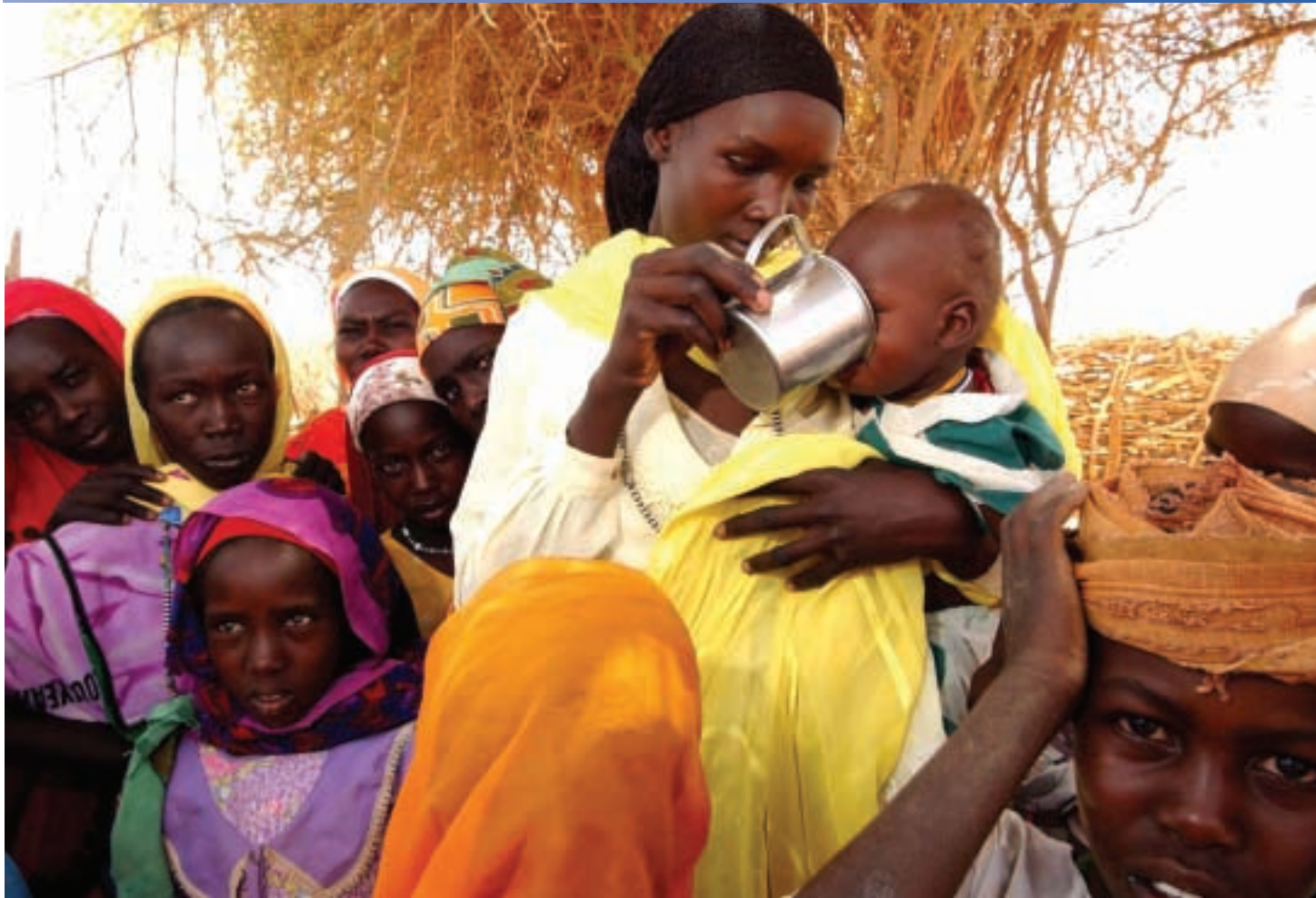
A refugee mother giving her baby water made clean and safe by PuR.