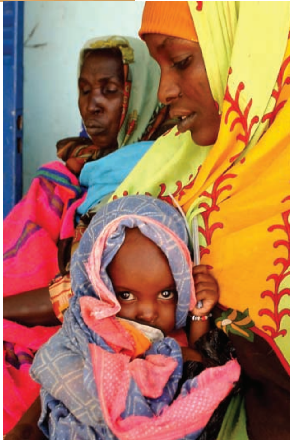
Refugees await medical care at an overwhelmed clinic in Bahai, Chad.

I am thankful we can bring assistance to these desperate people by supplying water purification tools, critical medicines and medical equipment. But it was hard to watch the extreme suffering knowing I come from a place where water runs freely and food is often thrown away. The stories, the sadness and the suffering will continue to haunt me. I can only hope the world acts quickly to help these people who have endured unthinkable atrocities. ★