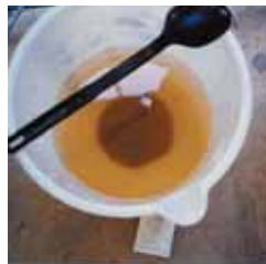
Floc Formation after PUR Addition