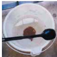
Floc Formation after Complete Stirring