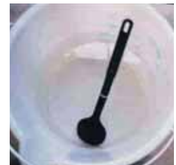
Clean Water Ready for Storage and Use