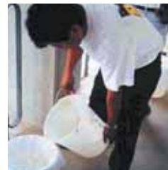
Decanting the Water Through a Clean Cotton Cloth Filter